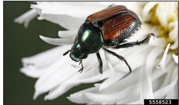
Figure 2. An adult Japanese beetle (Joseph Berger, Bugwood.org).

The small eggs (about 1.5 mm long) deposited in the soil are rarely observed. Japanese beetle larvae are similar to other species of white grubs with an off-white body and a tannish-brown head (Fig. 3). They curl into a C-shape when not actively crawling. Japanese beetle larvae have a distinctive V-shaped row of spines on the end of the abdomen that distinguishes them from other species of white grubs.