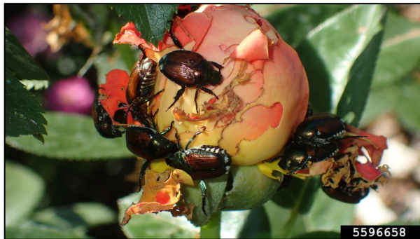
Figure 1. Adult Japanese beetles feeding together on a rose bud.

Japanese beetles ( Popillia japonica ) are destructive, invasive beetles that were accidentally introduced to the United States, probably in the soil of imported nursery stock. This pest has a wide host range and is difficult to control. Japanese beetle belongs to the family Scarabaeidae in the order Coleoptera.