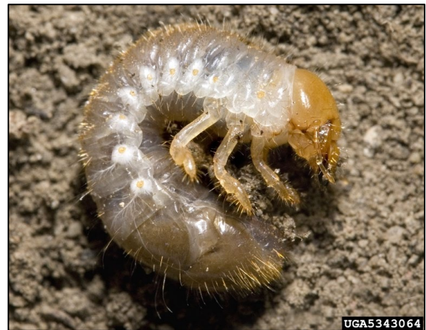
Figure 3. Japanese beetle larva.