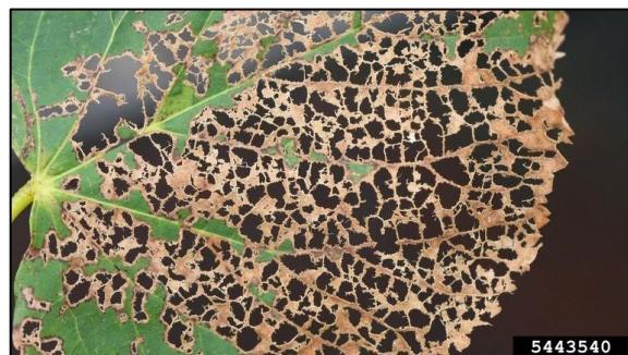
Figure 5. A leaf skeletonized by adult Japanese beetles.