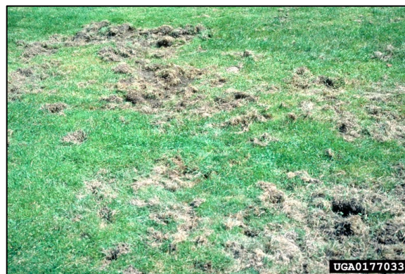
Figure 6. Lawn damage due to Japanese beetle larvae.