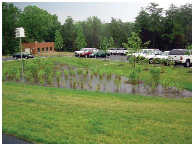
Figure 1. A sample bioretention cell or rain garden.

A bioretention cell , or rain garden , is a best management practice (BMP) designed to treat stormwater runoff from roofs, driveways, walkways, or lawns. They are a shallow, landscaped depression that receives, temporarily holds and and treats polluted stormwater with the goal of discharging water of a quality and quantity similar to that of a forested watershed (figure 1).