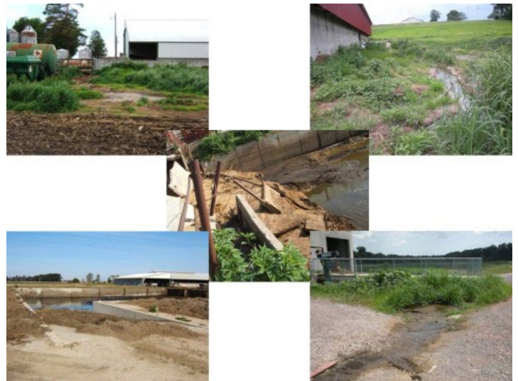
Figure 3. Example of undesirable situations around the farm.