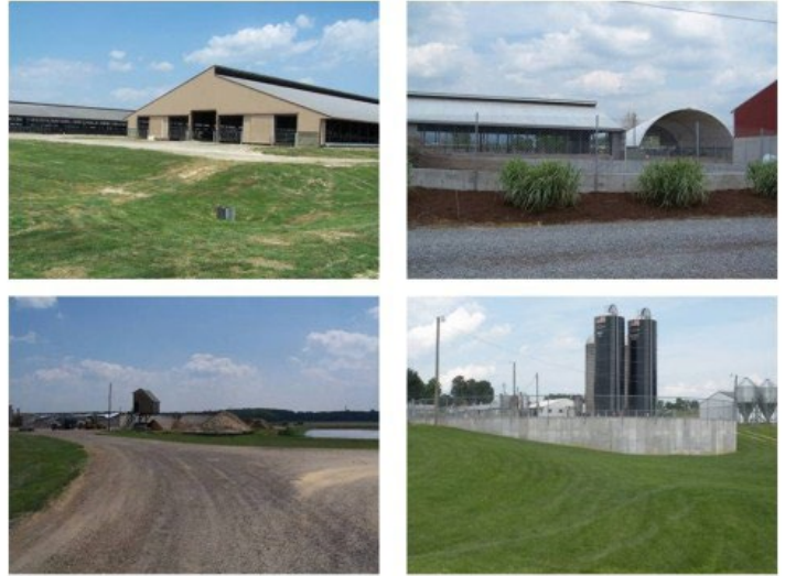
Figure 2. Examples of neatly kept farm surroundings.

Many times people tend to smell with their eyes more than their noses. It is therefore extremely important to have a neat facility, clean animals, well-tended crops and buildings, and machinery in good repair. Yards around barns and along the road and ditches should be mowed. It is not always possible to prevent all farm odors, but if people are presented with the picture of a clean, orderly, well-managed farm, they will tolerate more actual odor than from a farm that looks untidy (figures 2 and 3).