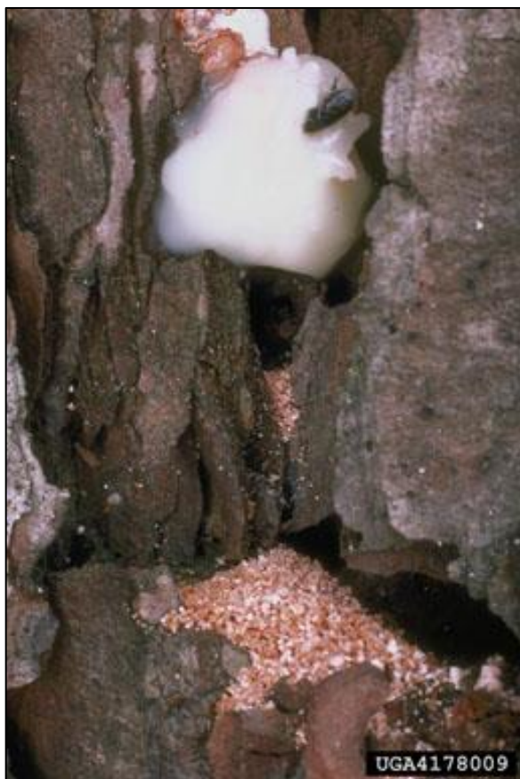
Fig. 2. A white pitch tube with a trapped southern pine beetle in it (top of photo) and an accumulated pile of reddish boring dust (bottom of photo).

Another sign of bark beetle activity is the accumulation of boring dust on the bark and at the base of the tree (Figure 2). This sawdust-like material is pushed out of the entrance holes of the beetles as they excavate galleries.