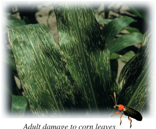
Adult damage to corn leaves