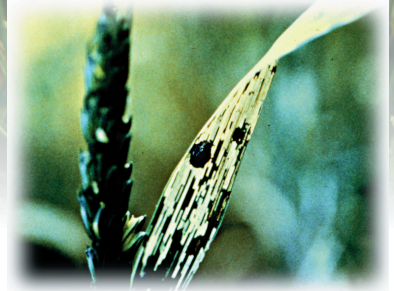
Larva removing green layer from leaf

Although adults will feed on young small grain plants, their feeding does not affect the plant's performance. Larvae eat long strips of green tissue from between leaf veins and may skeletonize entire leaves, leaving only the transparent lower leaf surface tissue.