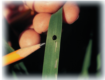
Adult cereal leaf beetle

Adult beetles are about 3/16 inch long and have metallic looking, bluish-black heads and wing covers. The legs and front segment of the thorax are rust-red.