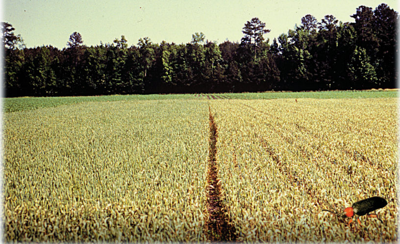
Field severely damaged by cereal leaf beetle