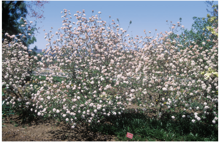
Viburnum carlesii (Koreanspice viburnum) is one of the parents of the burkwood viburnum and has the same traits listed for that hybrid. The popular cultivar 'Compactum' is more dense and compact than the species.