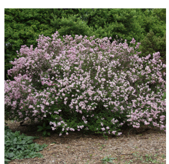
Viburnum x burkwoodii (burkwood viburnum) is a large shrub that flowers in April. It has very fragrant flowers, is relatively drought-tolerant, and has fair to good fall color. It is often used for shrub borders. Pictured here is the cultivar 'Mohawk'.