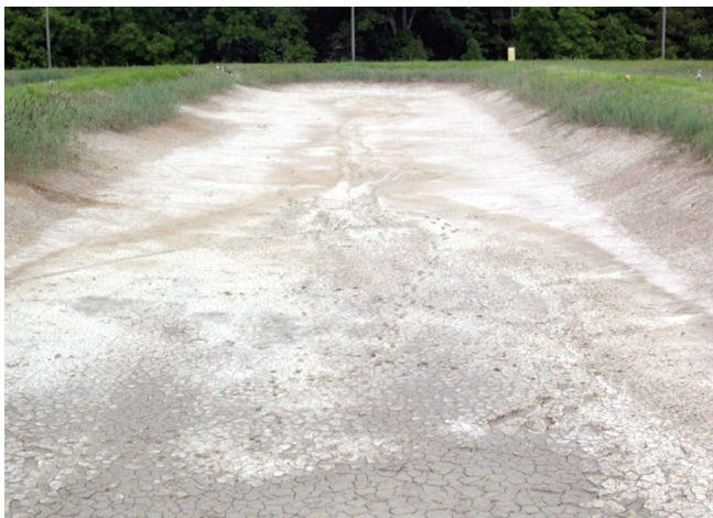
Proper design of ponds and levees will allow easy access for harvesting and will drain completely to provide for sun drying and disinfection.

Good aquaculture practices in pond design provide for adequate levee height and width to accommodate required production and harvest equipment. Ponds should have adequate depth to maintain seasonal water-quality parameters and thermal stability while minimizing seasonal stratification from a minimum of 3 feet on the shallow end to a maximum of 8 feet at the deep end. Pond levee slopes of at least three to one (3 feet wide for every 1 foot in elevation) are recommended to reduce wind-induced erosion and facilitate harvesting. Ponds should also have graded bottoms that are higher than discharge waters to allow for complete drainage as part of pond bottom mud and organics management. Ponds should have adequate levee height to absorb documented heavy rain episodes. For surface water locations, intake structures should be upstream of