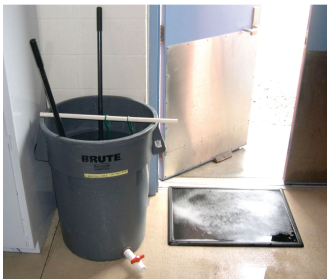
Simple net sanitation and footbaths are important biosecurity measures.

Developing a biosecurity plan is essential for all types of production systems. Care should be taken to minimize cross-contamination between ponds or tanks by sanitizing harvest gear such as seines, waders, nets, and hauling tanks; personnel access should be limited.