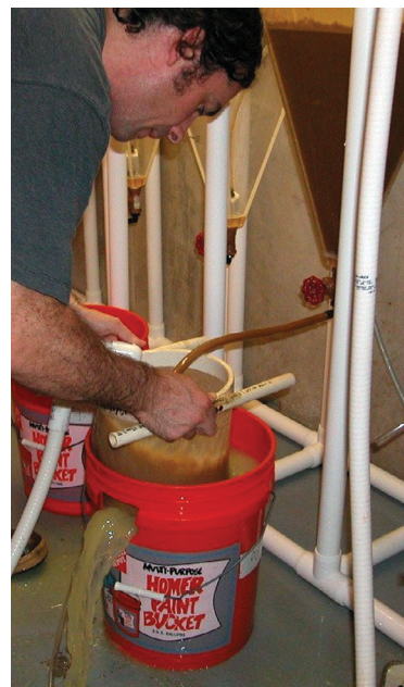
Figure 2. Harvesting decapsulated Artemia : note harvest bag and rinse water leaving bucket

When it is determined that the cysts are adequately decapsulated, add 75 g of sodium thiosulfate to the decapsulation vessel to neutralize the chlorine, then immediately begin to drain cysts into the 100 µm harvest bag. During the harvest process (Figure 2), rinse with ample amounts of water (fresh or salt) while providing ample aeration via an air stone to keep decapsulated cysts in suspension. When all decapsulated cysts have been collected, the remaining sodium thiosulfate should be added to the harvest bag. Continue rinsing the bag until water runs clear and no presence of chlorine can be detected.