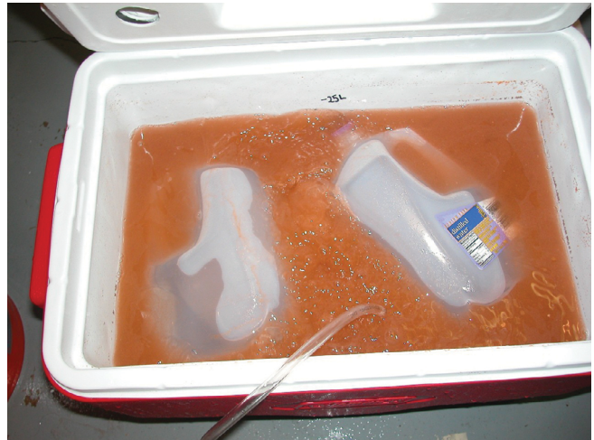
Figure 6. Cold-banked Artemia : ice jugs for temperature control and air line for aeration to keep Artemia suspended

Artemia not fed to larvae or enriched immediately needs to be stored under cold conditions. Cold storage of Artemia dramatically decreases its metabolism, which directly reduces further growth and metabolism of their protein and lipid stores. Artemia should be transferred to a cooler or suitable container and stored at 2°C to 10°C, with adequate aeration to prevent settling (Figure 6). An inexpensive digital thermometer with a 24 to 40 inch temperature probe makes it easy to verify that the cold bank temperature is in the proper range to keep the artemia alive, and maintain protein and lipid stores. Under these conditions, Artemia can be concentrated as high as 5,000 per milliliter and stored for up to 24 hours. One liter soda bottles or water bottles can be filled with salt water, recapped and frozen to make handy ice jugs for temperature control. It may take two to four one liter bottles to maintain the desired temperature for up to twelve hours, so it is important to have two to three times that many ice bottles so that they may be rotated back to the freezer while being replaced with frozen bottles.