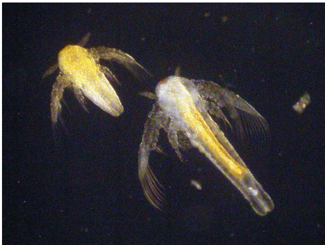
Figure 1. Artemia : just hatched (left), enriched and 24 hours old (right)

In Virginia and throughout the United States, freshwater and saltwater finfish and shrimp aquaculture is expanding rapidly. During the cultivation of most marine finfish and shrimp species – as well as some freshwater species – live feeds are an essential component during the larviculture stage. During larviculture, the rotifer is the most commonly used live feed upon transition of the larvae from endogenous (internal energy reserves) to exogenous (external) feeding. Upon completion of the rotifer stage, the most commonly used live feed prior to conversion of the larva to a dry diet is Artemia (Figure 1).