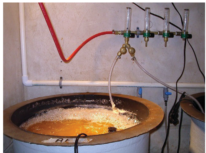
Figure 3. Artemia hatching cone: note pure oxygen injection regulators on wall and wire from submersible heater on front edge of tank

Generally, Artemia require 18 to 24 hours of incubation to hatch. Decapsulated cysts, however, may be ready to harvest after only 16 hours of incubation. When feeding nauplii directly to fish, timing of the hatch is very important. If nauplii remain in the hatching tank for too long, they will grow too large and their nutritional quality will decrease. Determining the endpoint of the hatch should be made through microscopic observation of the relative numbers of hatched nauplii, prehatched nauplii, and unhatched cysts.