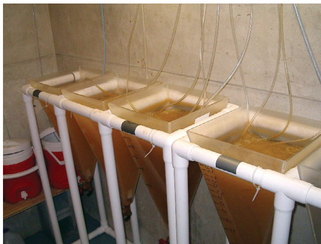
Figure 5. Multiple Artemia enrichment cones: note heavy aeration

During enrichment, vigorous aeration should be applied through the bottom of the enrichment vessel, and dissolved oxygen levels should be closely monitored throughout the process (Figure 5). The use of supplemental oxygen during this stage will likely be necessary to maintain oxygen levels above 4 milligrams per liter. Temperature must also be maintained at 25°C through the use of submersible heaters or ice packs, as dictated by ambient conditions.