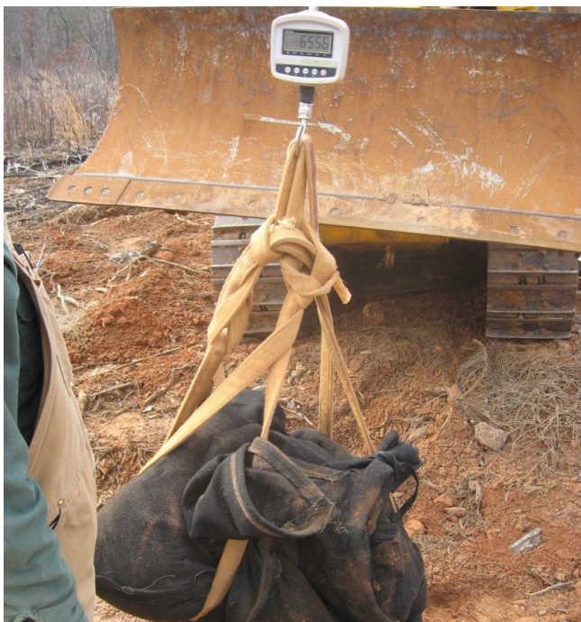
Figure 4. Sediment collecting “dirt bags” were weighed monthly to determine erosion from skid trails.