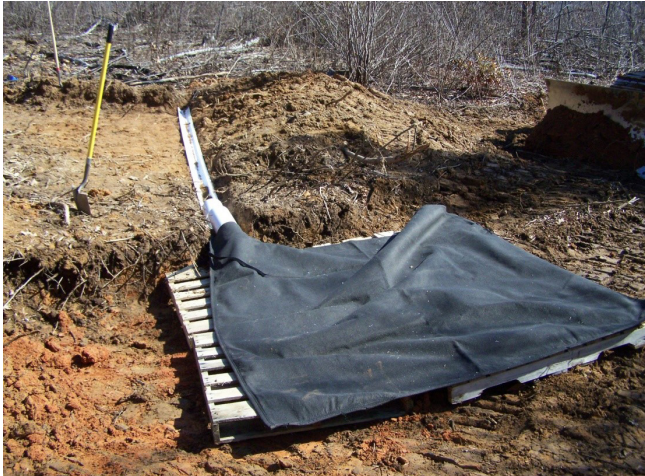
Figure 3. Runoff from skid trails was funneled into sediment collecting “dirt bags.”

Two sites on the Reynolds Homestead Forest Resources Research Center in Patrick County were used for these evaluations. One site evaluated bladed skid trails while the other evaluated overland skid trail closure methods. A designed experiment was used to replicate each of the five treatments. Runoff from each segment of the skid trail was funneled into a sediment filtering “dirt bag” that allowed collection of all sediment leaving the trail. The dirt bags were weighed and emptied monthly for one year.