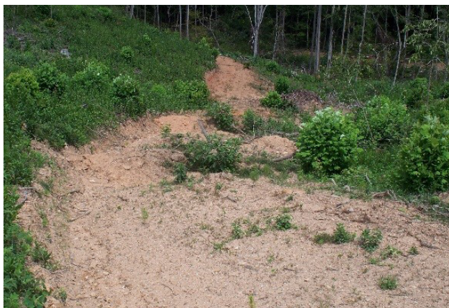
Figure 1. Multiple BMP options can be used to close out temporary skid trails.

Protection of water quality is a critical component of forest harvesting operations. Virginia’s silvicultural water quality law (§10.1-1181.1 through 10.1-1181.7) prohibits excessive sedimentation of streams as a result of silvicultural operations. Virginia’s logging businesses invest substantial resources implementing BMPs to protect water quality. The Virginia Department of Forestry (VDOP) is responsible for enforcing this law and inspects all logging operations to ensure protection of water quality. BMP guidelines offer multiple possible options for practices to minimize erosion and sedimentation and protect water quality. Selecting the most appropriate BMP will depend on specific site conditions, as well as resources available on-site for implementing BMPs. However, research results on BMP implementation can help guide decisions related to BMP implementation for protecting water quality.