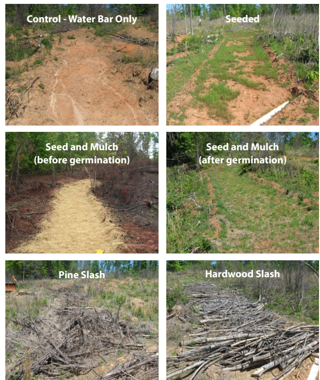
Figure 2. Temporary skid trail closure treatments.

This research focused on evaluating post-harvest erosion from skid trails with different closure methods. Both bladed skid trails and overland skid trails were evaluated using the same methods on similar sites. Researchers measured erosion from five different options for skid trail closure. The control treatment used water bars only. On the rest of the treatments, in addition to water bars, treatments evaluated the impacts of grass seed only, grass seed and mulch, hardwood slash, and pine slash.