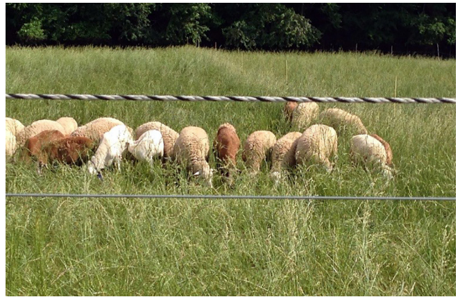
Figure 3. Purebred and crossbred (Dorset-sired) landrace hair sheep lambs grazing on pasture.

In addition to hybrid vigor, crossbreeding systems offer breed complementarity. For example, producers frequently breed hair sheep ewes to larger, heavier muscled ram breeds, such as a Suffolk, to obtain market animals that are hardier and faster-growing, and which also can meet market needs. In doing this, they are taking advantage of the qualities in both the maternal and paternal breeds: the hair sheep ewe’s traits of good mothering ability, no shearing requirements, and/or tolerance to heat and parasites, and the Suffolk ram’s traits of fast growth rate and muscling.