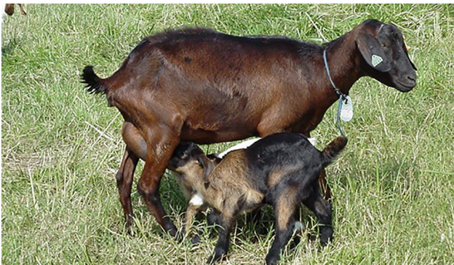
Figure 5. Spanish doe nursing twins.

For spring kidding/lambing, females should be bred in late September, October, and November for kidding/lambing starting in late February through April. This system coincides more with the natural mating and kidding/lambing seasons and, due to this, a greater offspring crop can be expected. All things considered, a lamb/kid crop of 150% (sheep) to 180% (goats) should be the goal. Ovulation rates and male fertility are at a peak during fall breeding and embryo loss should be minimal due to cooler temperatures. However, under this system, offspring won't be ready for market until later in the season and possibly on pasture where internal parasites might be a problem.