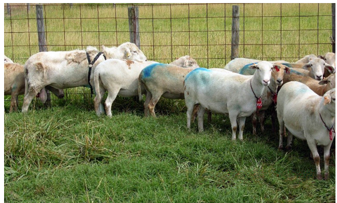
Figure 1. A breeding group of Katahdin hair sheep. (Reprinted with permission from Stephan Wildeus, 2007)

A purebred animal is a member of a specific breed that possesses similar characteristics/traits and shares common ancestry. Pure-breeding is the mating of females and males within the same breed or type. Figure 1 provides an example of a purebred breeding group of Katahdin hair sheep. These animals are eligible for registration in associations for that breed. While there are pros and cons to pure-breeding, the major goal is to provide animals with superior genetics for marketing to other purebred or commercial producers. Purebred animals can be sold at higher prices and therefore offer a chance for increased profitability.