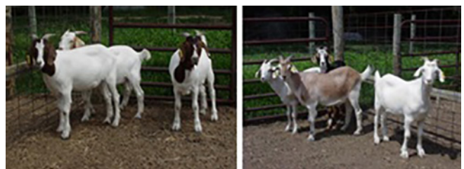
Figure 4. F1 Boer and Kiko sired kids from Spanish dams at Virginia State University.

“Grading up” is the system of breeding in which a purebred male of a given breed is mated to graded (not eligible for registration) females and their daughters with the goal of creating a flock similar in quality and performance to the sire breed. This practice is used when only the males of a desired breed are available and allows producers to raise purebred-quality animals without the investment in purebred females.