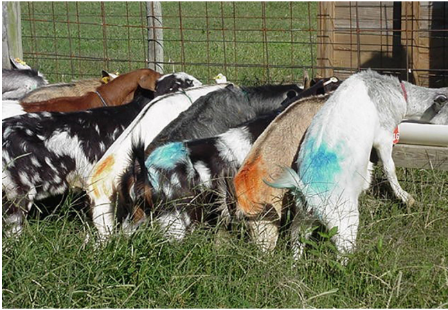
Figure 2. A group of Spanish and Myotonic females eating at a fence line feeder.

animals would carry the same undesirable traits. It is also the most widely used mating system by purebred/seedstock and commercial producers.