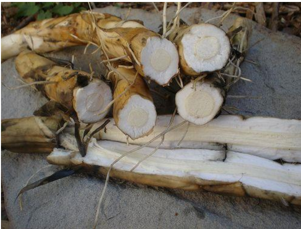
Figure 2. The roots of cattails are quite edible.