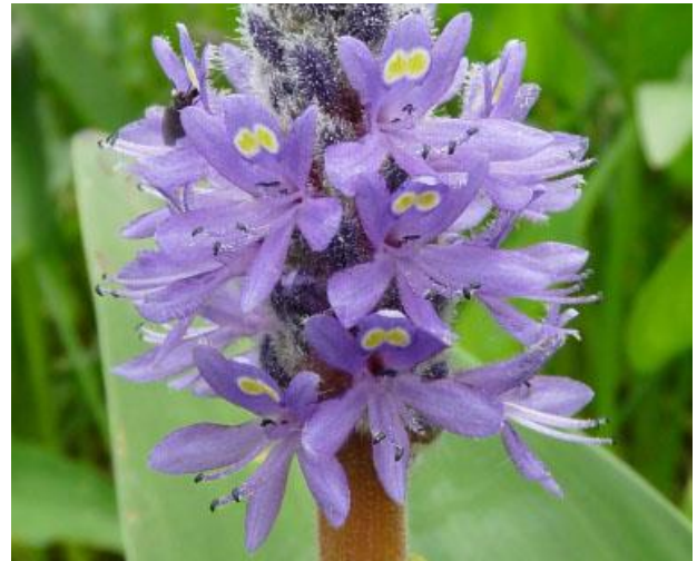
Figure 7. Close up of pickerelweed flower stalk