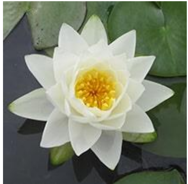
Figure 3. Close up of water lily flower.