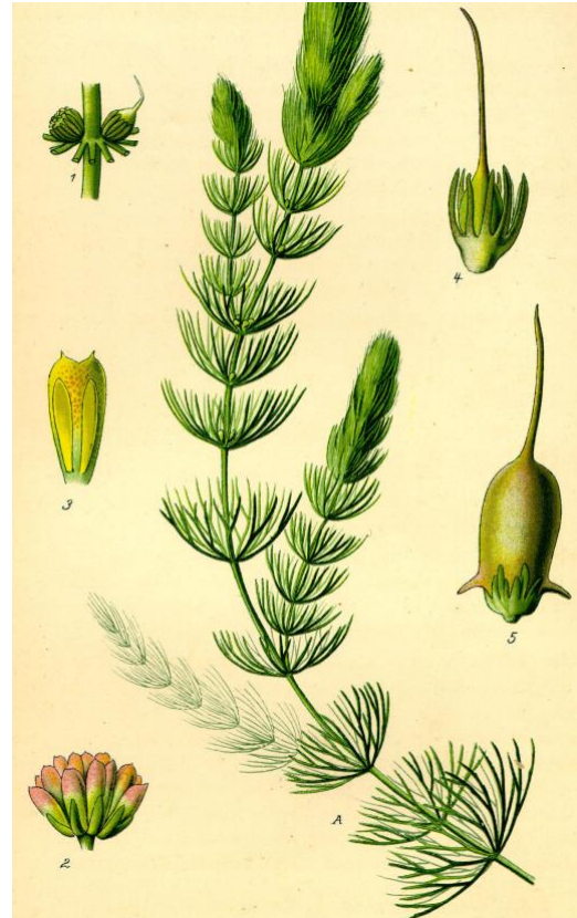
Figure 9. Coontail/Hornwort Parts