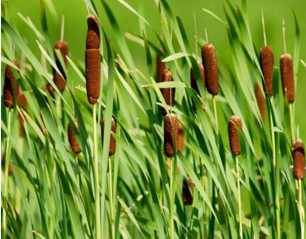
Figure 1. A typical cattail has fruiting bodies that resemble a cigar.