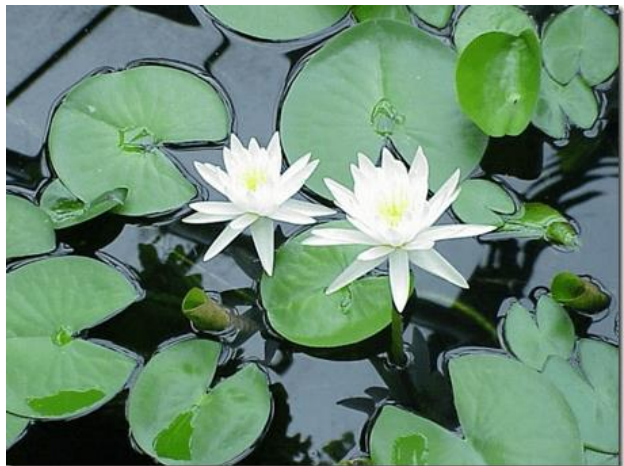
Figure 4. Water lily flower and leaves.