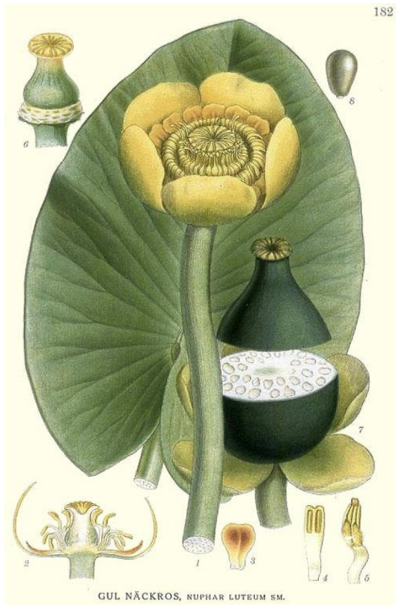
Figure 5. Water lily parts