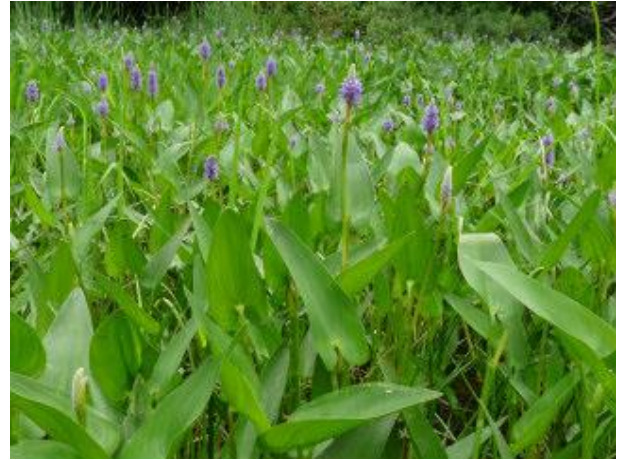
Figure 6. Pickerelweed in bloom covering pond.

when roasted, but they can be eaten raw or cooked. The seeds are best collected when they fall into your hand right off the plant. They can be ground and made into flour or toss some seeds into your bread recipe. The young leaves can be eaten as greens; boil older leaves before ingesting. Young stalks are also edible.