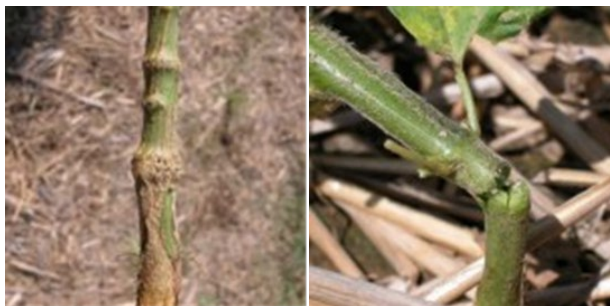
Figure 3. Girdling and breakage in soybeans as a result of injury from nymphs and adults (Stewart et. al 2017).

Threecornered alfalfa hopper has piercing-sucking mouthparts and feeds on phloem in the stem of plants less than 30 cm tall. Prolonged feeding may result in plant death or a girdle that can cause the plant stem to break before harvest (Fig. 3). Girdling can cause the plant stem to weaken and break during windy conditions. Additionally, girdling restricts the transport of nutrients and can lower grain yield on affected plants (Reisig 2021). Girdling of additional structures (e.g. petioles and peduncles) do not cause yield loss.