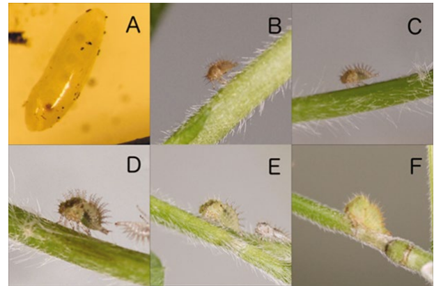
Figure 1. Egg (A) and nymphal growth from hatching to final instar (B-F) (Beyer et al. 2017).

Adults maintain the same wedge shape as the nymphs and are green. Adults range in size from 6-6.5mm. Adult females are larger than males, and males have a red/orange stripe running along its top (Fig. 2) (Beyer et al. 2017).