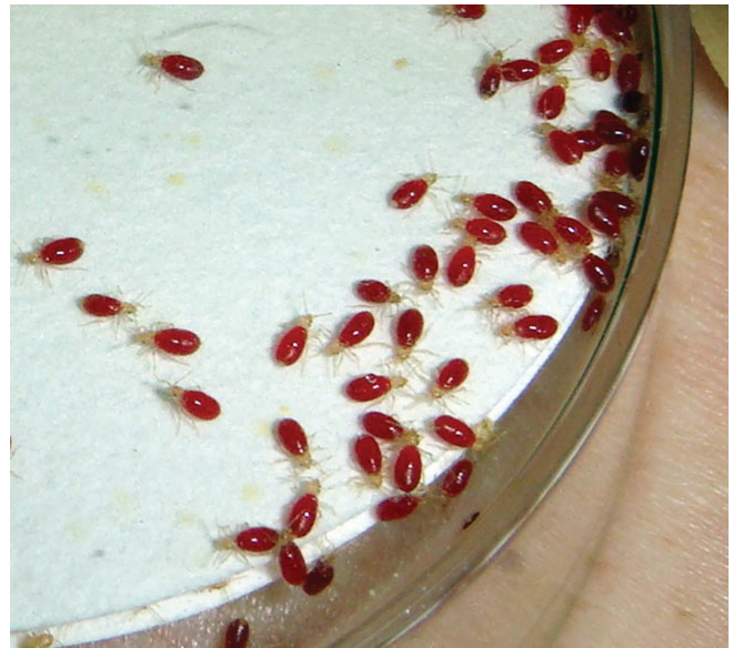
First instars after feeding

The time it takes any particular bed bug nymph to develop depends on the ambient temperature and the presence of a host. Under favorable conditions, such as a typical indoor room temperature (>70° F), most nymphs will develop to the next instar within 5 days of taking a blood meal. If the newly molted instar is able to take a blood meal within the first 24 hours of molting it will remain in that instar for 5-8 days before molting again. At lower temperatures (50° F - 60° F), a particular instar may take two or three days longer to molt to the next life stage than a nymph living at room temperature. However, if a bed bug nymph does not have access to a host, it will stay in that current instar until it is able to find a blood meal, or it dies. The time for a bed bug to develop from an egg, through all five nymphal instars, and into a reproductive adult is approximately 37 days.