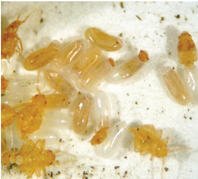
Bed bug eggs hatching