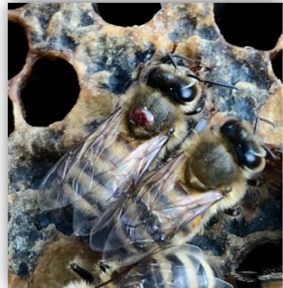
Figure 1. Adult female Varroa mite on the thorax of a worker bee.

During the travelling stage, Varroa mites cling to the body of their host (Figure 1) and prefer to stay on nurse bees, which have the most access to bee brood. This access is important, since Varroa mites lay their eggs in brood cells. The travelling stage can last for months and is believed to be important to the mite reproductive process by allowing for spermatozoa activation. The reproductive stage begins when a travelling female mite drops off of her host and into an uncapped brood cell. This adult female will then hide in brood food at the bottom of the cell and wait 60-70 hours for the cell to be capped. She will then lay one unfertilized male egg. After the male egg, a fertilized female egg is laid approximately 30 hours later. Other female eggs follow at 26-32-hour intervals. The male egg is laid