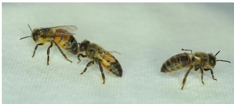
Figure 3. Apparent symptoms of deformed wing virus (DWV), which is one of the many viruses transmitted to bees through Varroa Mites. The worker on the left does not show any outward symptoms but is from the same hive as the other two bees with obvious symptoms.

Varroa mites feed on the honey bee fat body, which weakens host immunity and ultimately impacts bee nutrition, playing an important role in colony overwintering success. Additionally, Varroa mites are also known to transmit numerous viruses. Of the 18 known honey bee viruses, six are of primary concern, including: Deformed Wing Virus (DWV), Black queen cell virus (BQCV), Sac brood virus (SBV), Kashmir bee virus (KBV), Acute bee paralysis virus (ABPV), and Chronic bee paralysis virus (CBPV). However, DWV is now the most frequently observed of these viruses. The prevalence of DWV has caused the identification of European honey bees with symptomatic DWV to be a key indicator of Varroa mite infestation. Aside from the wing deformities that characterize this virus, symptoms of DWV can also include paralysis, abdominal bloating, early death, and learning deficiencies. However, it has been observed that over 99% of bees with DWV are asymptomatic (no wing deformities), making it difficult to grasp disease prevalence in the hive until it is too late. Because DWV can also replicate in European honey bees, it can be passed to eggs through the ovaries and spermatheca of infected queens