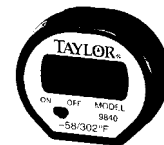
Termómetro digital Área sensible de 1/2"