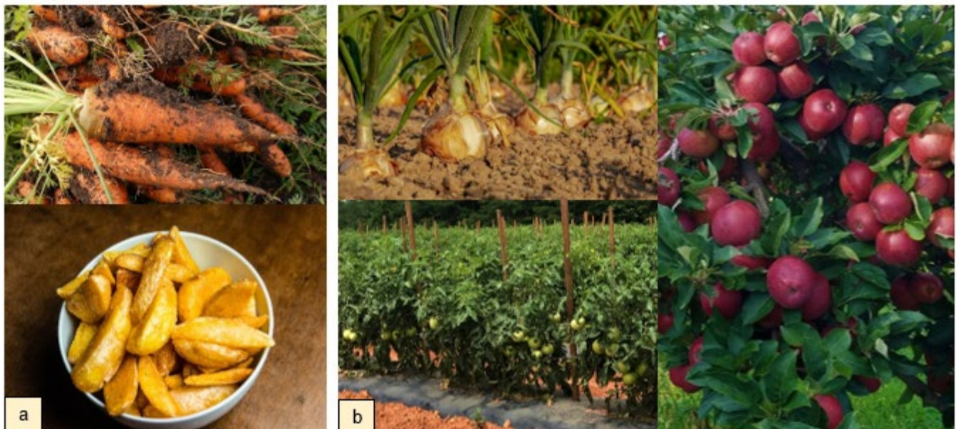
Figure 3. (a) Both carrots and potatoes are grown underground; however, carrots may be eaten either raw or cooked whereas potatoes are typically cooked. (b) Onions, tomatoes, and apples are eaten as both raw and cooked; however, onions come into direct contact with the soil, whereas tomatoes and apples are aboveground. In all cases, it is a good idea to consider the potential risks for each crop at pre-plant, production, harvest, and post-harvest stages.

An important consideration at the pre-plant stage also includes plant morphology and anatomy, or the external and internal characteristics of the crop plant. It can be especially important to identify the parts of the plant that will be harvested for food when evaluating risks (Figure 3). Is the harvested portion above ground or below ground? If it is below ground, is the food typically eaten raw or cooked (e.g., carrots versus potatoes)? If the harvested portion is above ground, does it grow on the ground directly (e.g., summer squash, winter squash, onions), or is it aboveground (e.g., staked tomatoes, apple trees)? Are each of these types of produce eaten raw or are they cooked? You should also consider the susceptibility of the fruit or vegetable for infiltration of microorganisms. There is research to support internalization of human pathogens through the roots, stomata, or blossoms. You should also determine if the crop surface poses any additional risks. For example, some cantaloupe has a netted rind, which may promote attachment of microorganisms. It may be helpful to reach out to your local extension agent or specialist to discuss your crops and the latest research on those crops in regards to food safety.