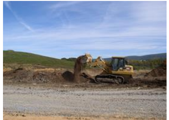
Composting Mortality at the Shenandoah County Landfill

Some county landfills accept animal mortality from farms in their locality. Landfills will either bury or compost the animal mortality. Availability, price and drop-off times will vary by county, so contact your local landfill or Extension Office for more information.