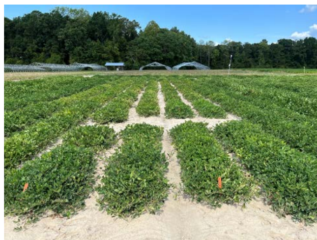
Figure 3. Rainout plots at TAREC Research Farm after the shelters were removed in end-August 2022.