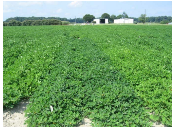
Figure 1. PVQE trials at TAREC Research Farm.

The objectives of the PVQE are to determine yield, grade and quality of commercial cultivars and advanced breeding lines at various locations in the VC region, develop a database for virginia-type peanut to allow research-based selection of the best genotypes by growers, industry, and the breeding programs, and to identify the best peanut varieties that can be developed into cultivars.